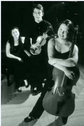
The Mendelssohn Piano Trio performs as part of Music, Gettysburg!