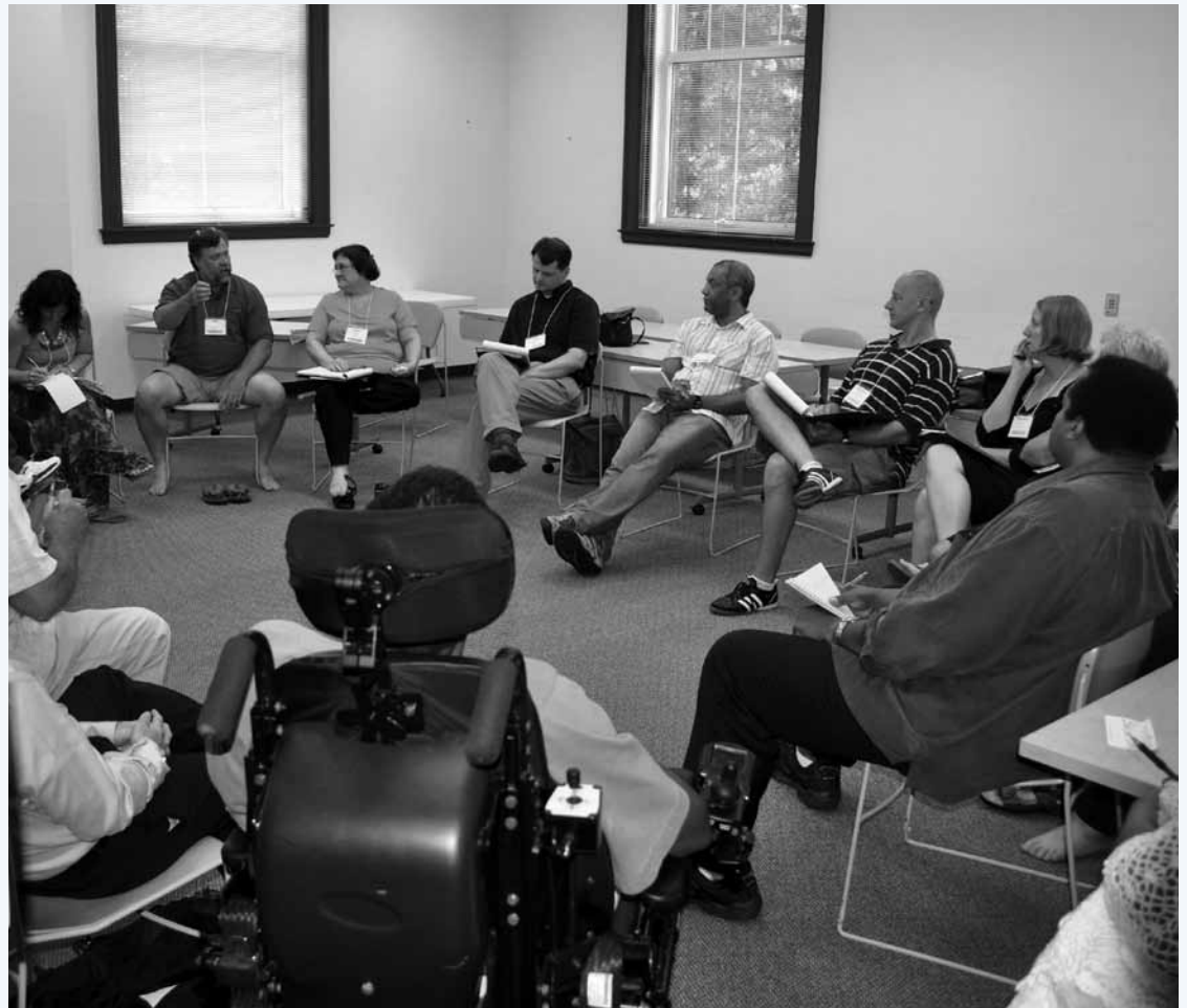
In July, 2011, the Gettysburg Seminary campus was the site for the Institute for Theology and Disability.