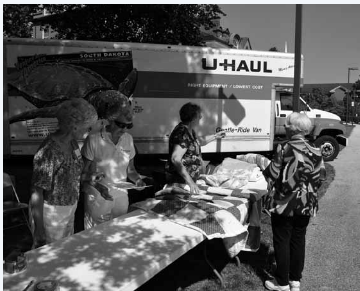
August 2011 in Schmucker Grove: Collecting quilts at the FrOGS (Friends of Gettysburg Seminars) "Quilt-the-Campus" and Leap-In event.